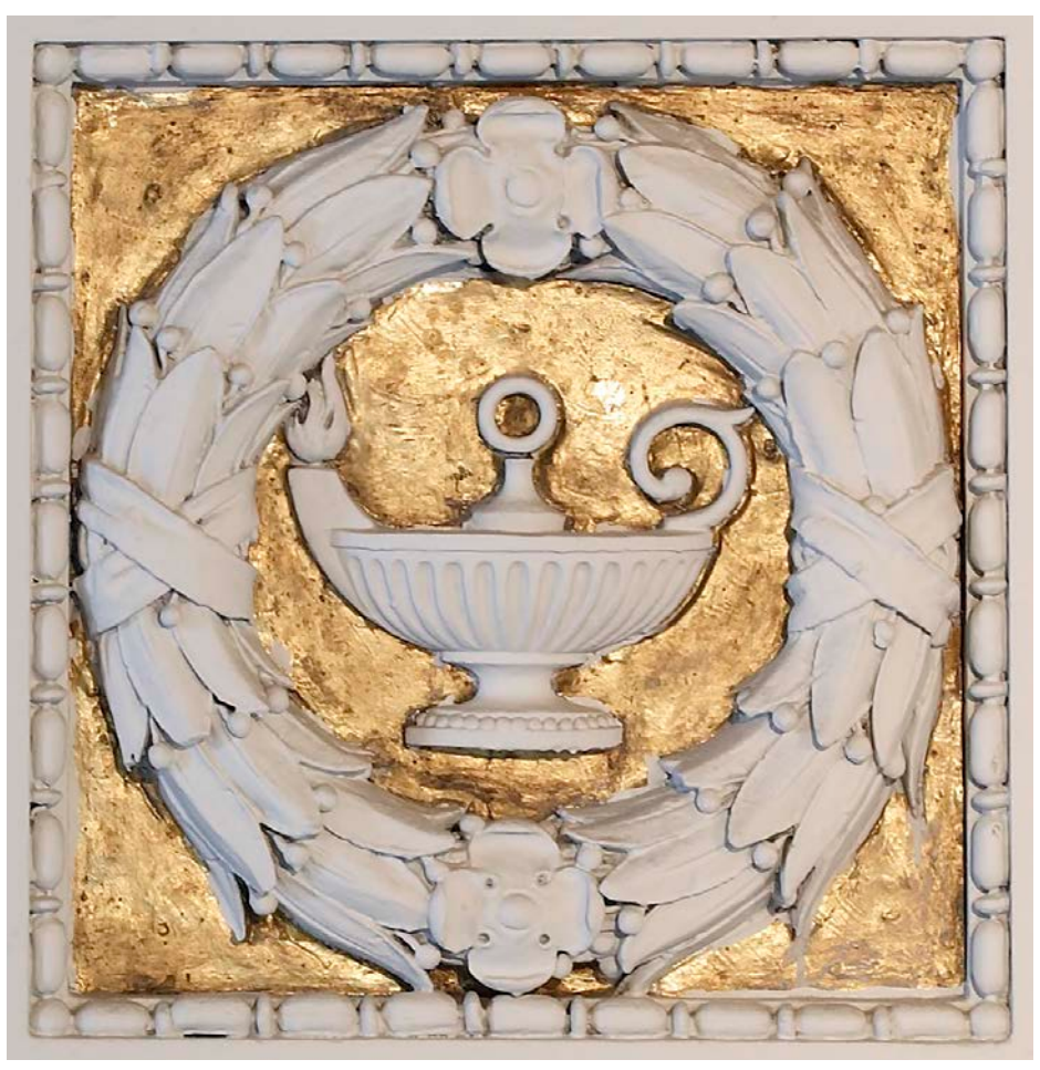
Detail of sculpted wreath surrounding lamp of learning. Library of Congress Thomas Jefferson Building second floor corridor, Washington, D.C.

Center for Learning, Literacy and Engagement