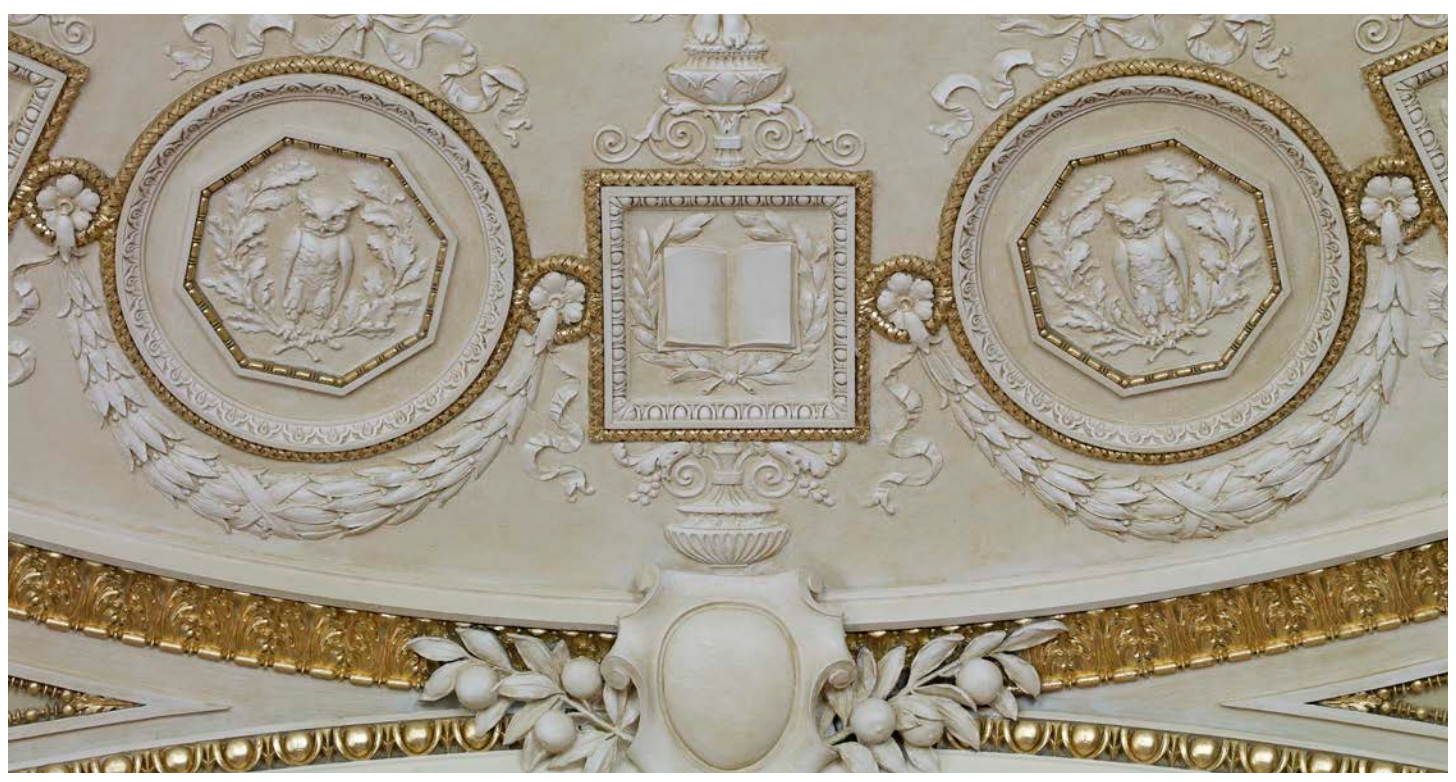
(2007) Detail of stucco reliefs around dome. Library of Congress Thomas Jefferson Building Librarian's Room, Washington, D.C.